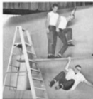
Stage Crew downs in few time.

During the greater part of the year, the members meet once a week, but, as performance time draws near, they meet more frequently in order to finish everything on time. These boys deserve a lot of credit for the difficult job that they do so well.