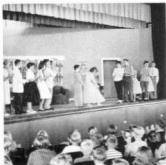
Final curtain call.