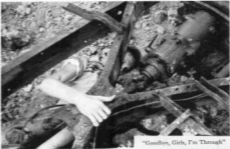
"Goodbye, Girls, I'm Through"