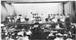
Sam's words, "We couldn't fit the illustrations on the paper . . ." brought the house down at the Yearbook Assembly.