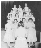
Ensemble, miniature edition of chorus, provides Christmas harmony.