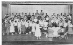
Informal chorus rehearsal.