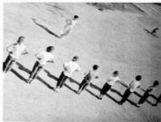
J.V. hopefuls trying out

The J.V. Cheerleaders have different cheers and motions from those used by the Varsity Cheerleaders. When they become Sophomores, these girls are eligible to "step into the shoes" of the Varsity Cheerleaders.