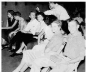
Let's sit this one out.