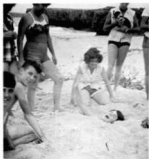
Muff struggles under a load of sand on the Newman Club picnic.