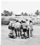
Get in there and fight!