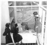
Ginger's Mouse holds out his greeting.